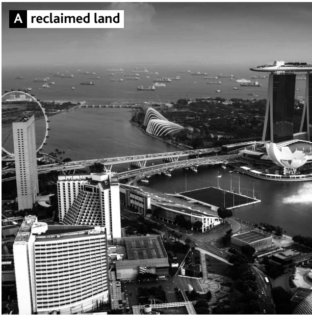
A reclaimed land